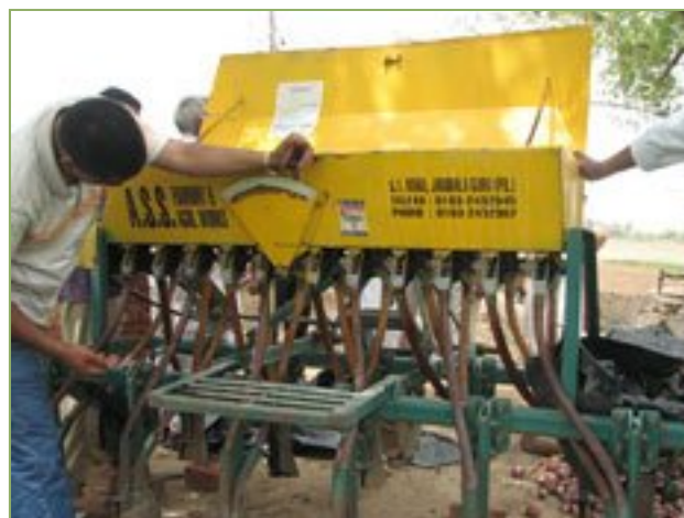
An indigenously produced “No Till Seed-cum-Fertilizer Drill”

What convinced farmers was a saving of Rs. 1,000/acre on tillage related tractor costs with no loss of productivity. Moreover this led to more time being available to farmers, now relieved of the tilling responsibility and women were relieved of the drudgery of their post-seeding tilling responsibility. The credit for this effort goes to the Krishi Vigyan Kendra (KVK) located at Mahendergarh, ably managed and supported by the Haryana Agricultural University, Hissar. KVKs are farmer science centres belonging to Haryana Agriculture University, supported by the ICAR, Ministry of Agriculture, Govt. of India. Other than playing a very effective extension role, they also helped provide a Drill machine (picture below) that facilitated the seeding and fertiliser placement process in an untilled land. The efforts in Tigra were encouraged by the ATMA initiative taken up by the Haryana Government agriculture officials.